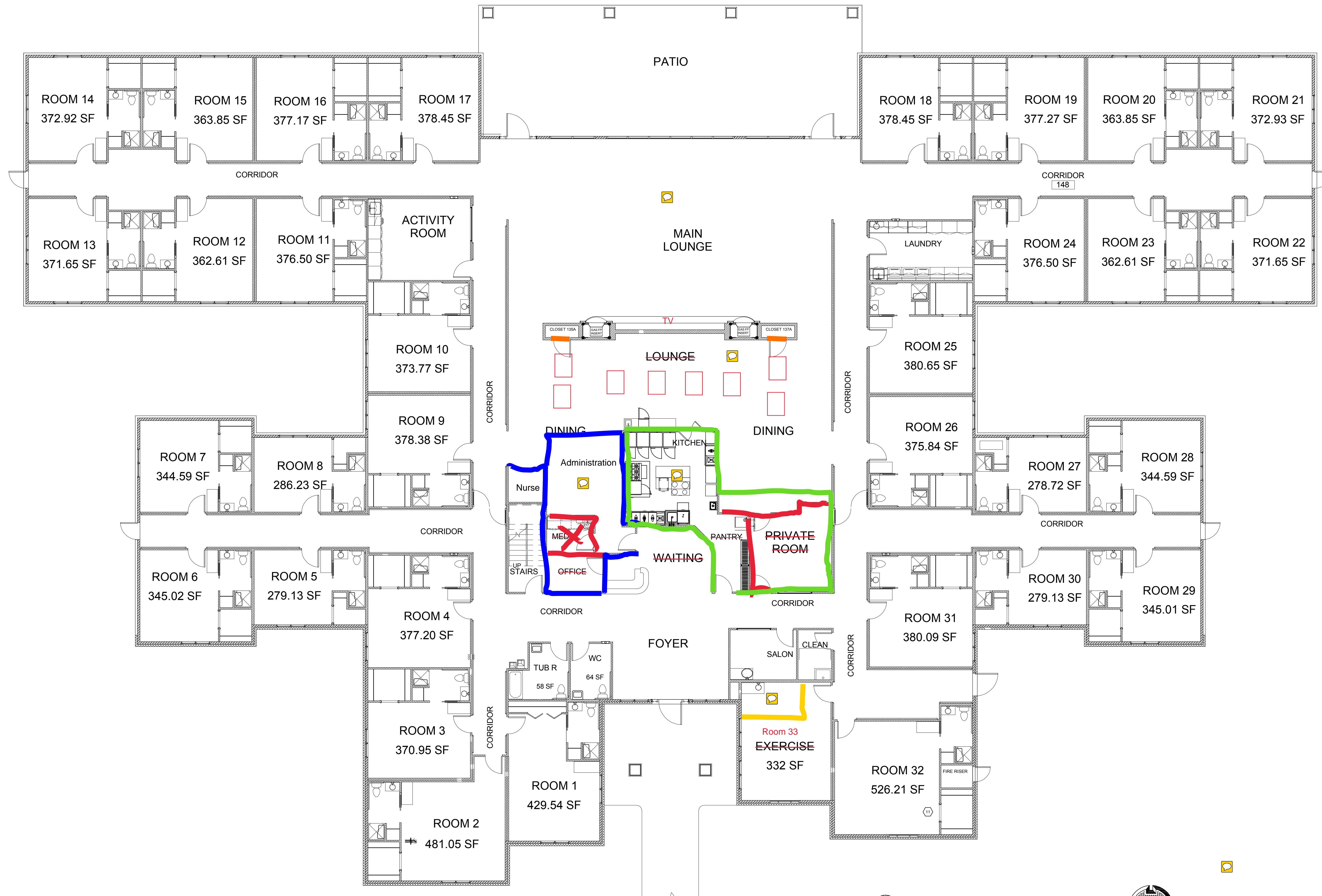
1 MAIN FLOOR PLAN 1/8" = 1'-0"